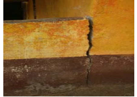
Another porch wall crack