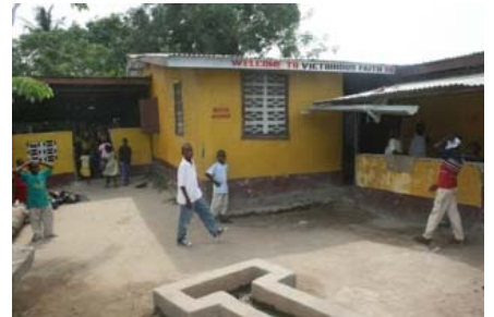
Need for painting