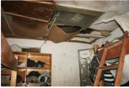
Ceiling trouble due to leakage