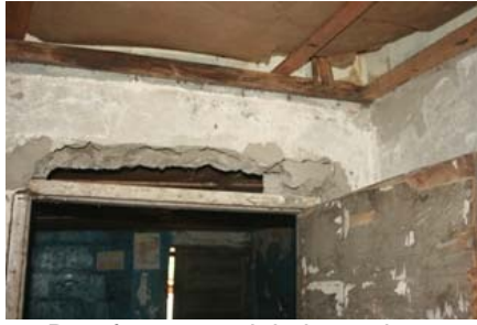
Doorframe crack in boys dorm