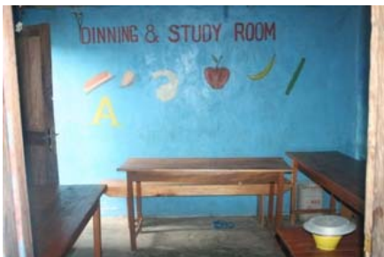
Dining room in-tact