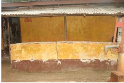
Crack in the porch wall