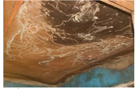
Ceiling trouble due to leakage