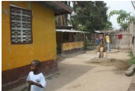
Need for painting