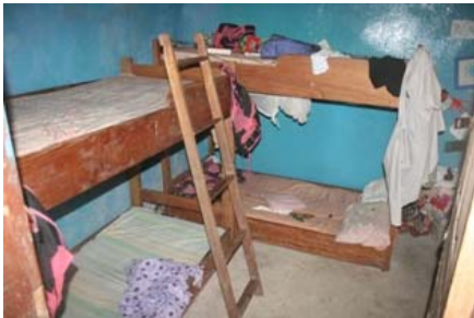
Girl's dorm in-tact